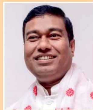
Rameswar Teli Minister of State, Food Processing Industries