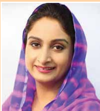
Harsimrat Kaur Badal Minister of Food Processing Industries